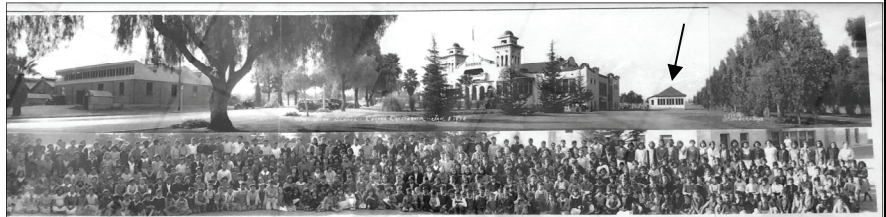
Panoramic image of the first Washington School site and students in January 1936.

I am convinced that our city is filled with treasures such as these that may be intentionally or unintentionally discarded or are destroyed a little more each day.