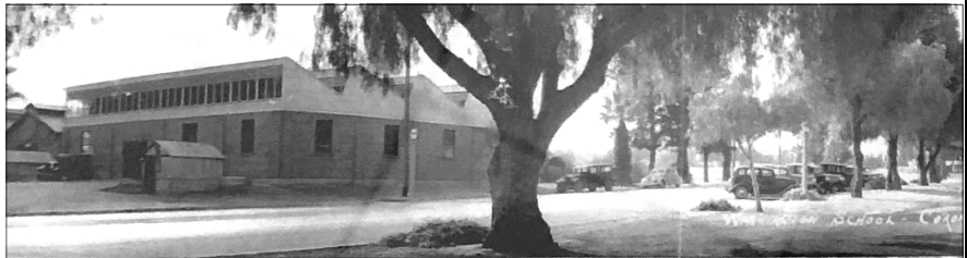
View of pump house (now Corona Marine) across Grand Boulevard with Pepper Trees in the parkway and diagonally parked cars in view.

The photo of Washington School seems to be a familiar angle and really shows off the beauty of the school (at least the front of it.) The most fascinating image in the photo is the little white building to the right. According to Mary Winn, this was once the first Washington School kindergarten building. It had previously served as an additional classroom building at Corona Grammar School (later became Lincoln School) on 10th Street and at the first Corona High School at 1230 South Main Street. The building was moved yet again and currently is located at 507 S. Vicentia, Its claim to fame is that it has been moved intact more than any other building in Corona. It has been many years since it hosted kindergarteners, but it continues to serve this community as the Corona-Norco Settlement House. On the left side of the picture is a pump house that still stands and is currently occupied by Corona Marine.