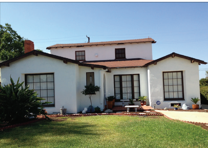
1116 S. Vicentia

1124 S. Vicentia is a 1930 Mediterranean/Spanish Colonial Revival single family home