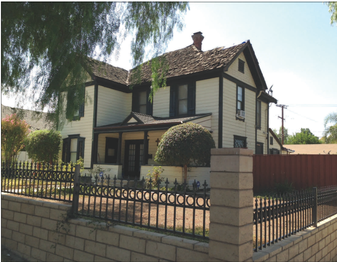
1002 S. Victoria