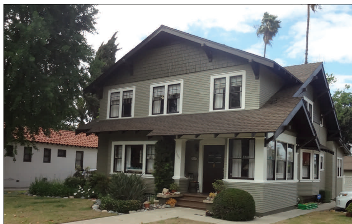
1164 E. Grand Blvd after painting is completed