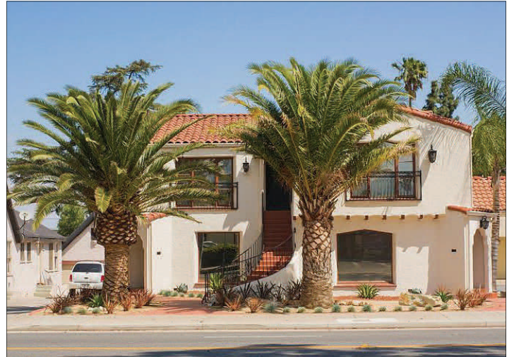
711 West Sixth Street