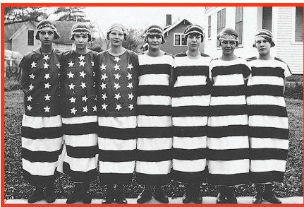
Ladies decked out as an American flag

P.O. Box 2904 Corona, California 92878-2904