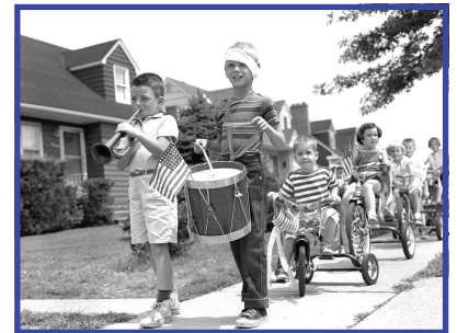
Simple sidewalk parade