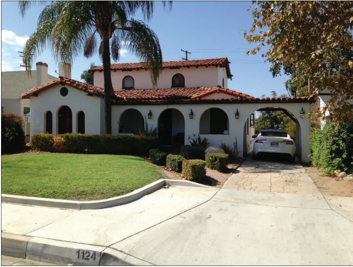
1124 S. Vicentia