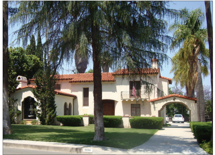
1926 South Main Street