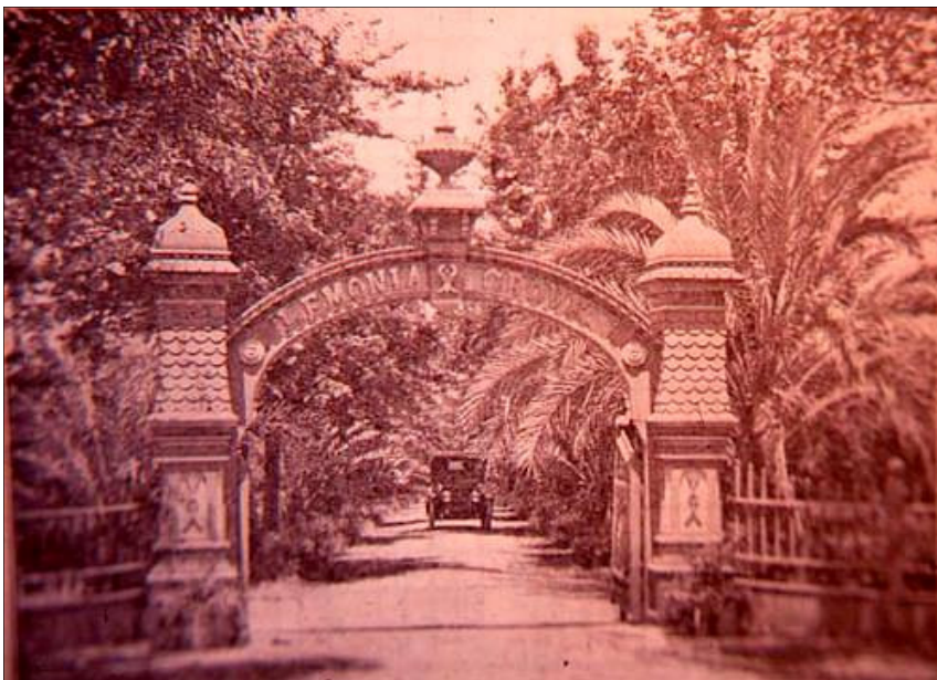
An historic view of the original decorative gate on Chase Drive that welcomed all who came to visit Lemonia Grove up until the 1940s.