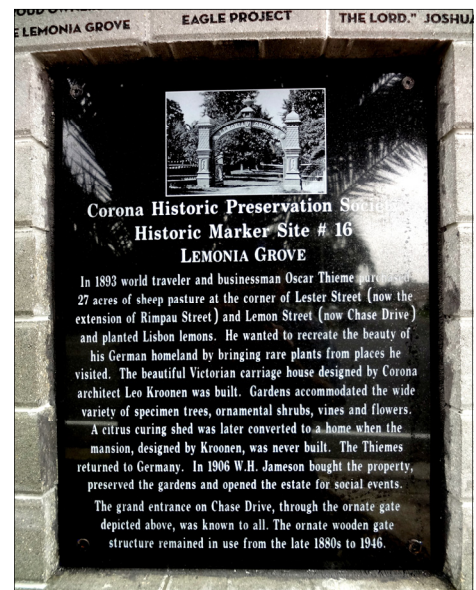
Monument is located to the left of Rimpau entry gate.