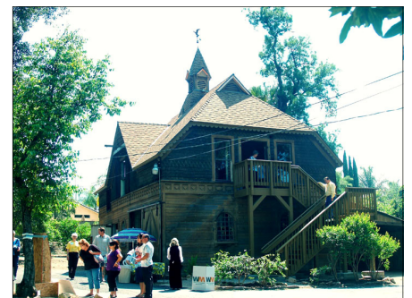
1893 Carriage house at Lemonia Grove

Join Us at Lemonia Grove See page 5 for details