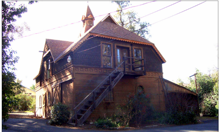
A view of the carriage house prior to reconstruction of the staircase with help from a CHPS grant.