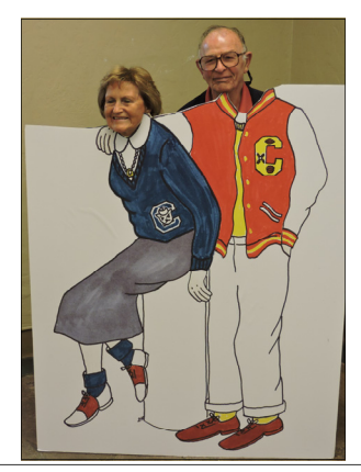
Cutouts from the past (made of foam core) provided fun photos of attendees.