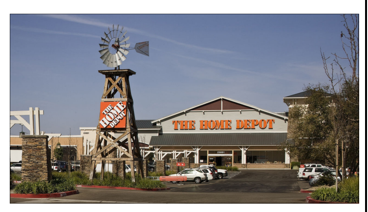
Historic architectural elements responsive to local design guidelines can be seen in these two photographs of a shopping center located in Lake Forest and designed by Architects Orange.