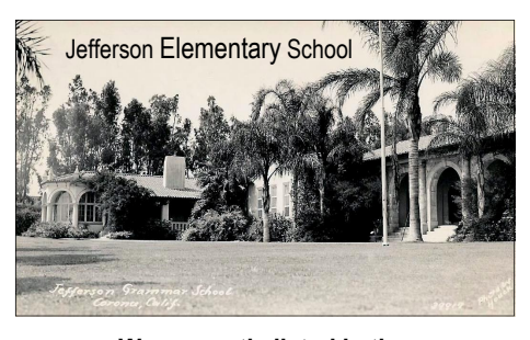
Was recently listed in the National Register of Historic Places!

P.O. Box 2904 Corona, California 92878-2904