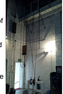
Backstage view of the stage door, catwalk, curtain counterweights and ropes

four people in the tour group had viewed movies in the old Corona Theatre. (At least one, who shall remain unnamed, remembered sneaking in the side door while in his youth.)