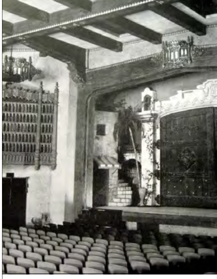
An early photograph of the interior of Corona Theatre featuring huge wooden garden gates behind which the movie screen was located.